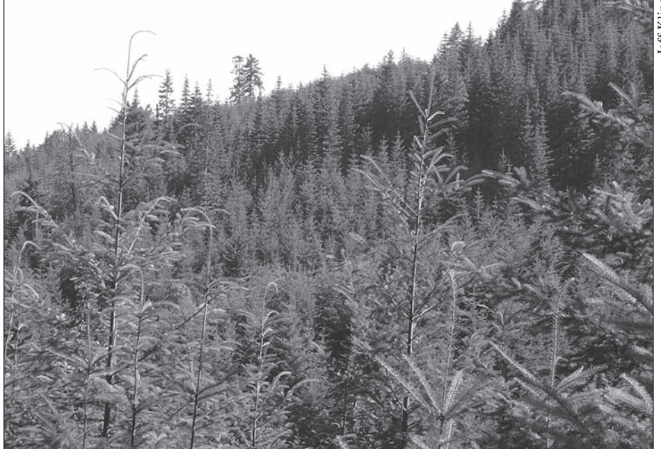
Forest land stores more carbon than other land uses, but is the land type most likely to be developed nationwide.

for a different study. The model could be used to project future land use for western Oregon with and without Oregon's land use program in effect. After talking a bit, the two scientists realized that by using Kline's model and Cathcart's carbon numbers, "We'd be able to figure out how much carbon storage would have been lost without land use planning," Cathcart says. It also enabled the scientists to consider how extensive a role land use planning could play in future carbon sequestration strategies.