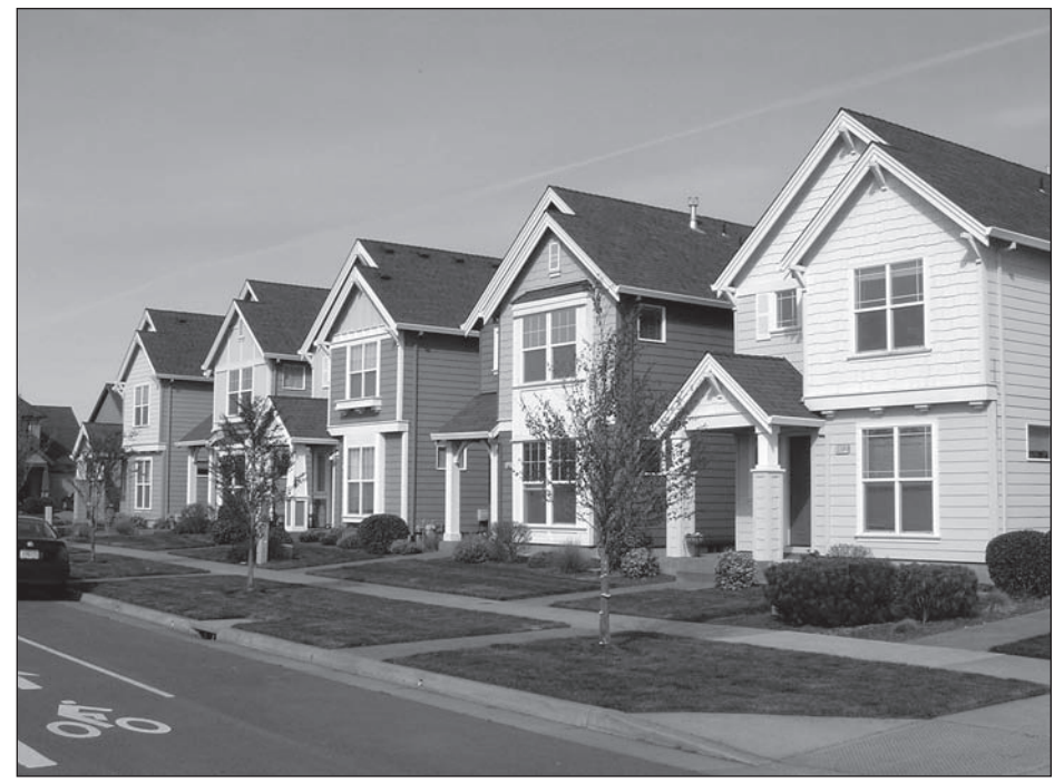
Oregon's land use planning program has encouraged high-density development within urban growth boundaries.

contributions to addressing climate change until the issues involved with carbon trading and offset programs are resolved, or society becomes more amendable to taxing carbon emissions."