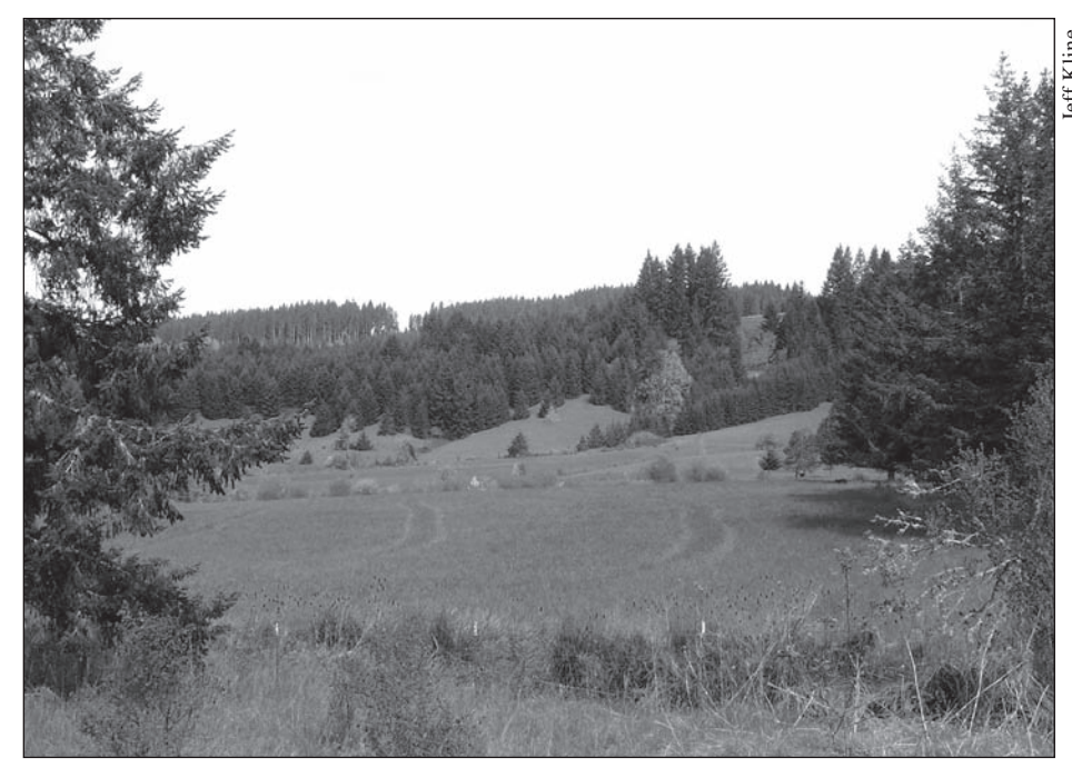
By maintaining forest and farm land, Oregon avoided an estimated 1.7 million metric tons of carbon emissions annually between 1974 and 2004.

"While we wait for stronger climate change policies to be implemented, we don't want to forget about what we're already doing," says Kline. "Existing forest land conservation policies and programs can make significant